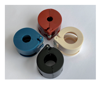
Figure 2: Unlocking tools for spring-lock connectors