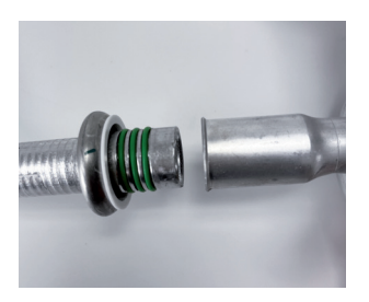
Figure 1: Separated spring-lock connection

seals. For assembly, the line is simply pushed into the connector until the spring is felt to engage.