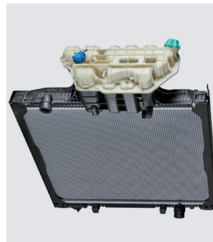
Figure 1: MAN radiator with compensating tank

In the abovementioned radiators, the cooler and expansion tank form a single unit. If the expansion tank is overfilled, excess coolant escapes via the pressure compensation valve of the blue cap as the engine temperature or system pressure rises. Coolant that has escaped at the top or has run next to the fill port during filling flows downward via drainage channels and escapes again between the cooler and the expansion tank—which can then be incorrectly interpreted as a leak.