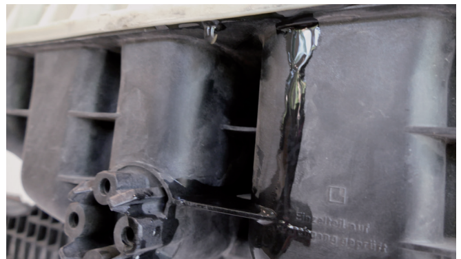
Figure 3: Excess coolant escaping again around the joint face on the expansion tank