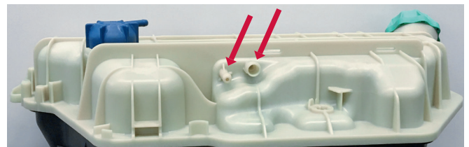
Figure 2: New-generation expansion tank with two connections