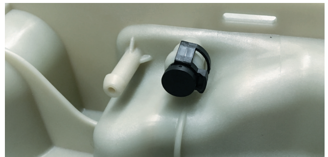
Figure 3: For Euro 4 and 5, the connection must be sealed using a dummy plug.