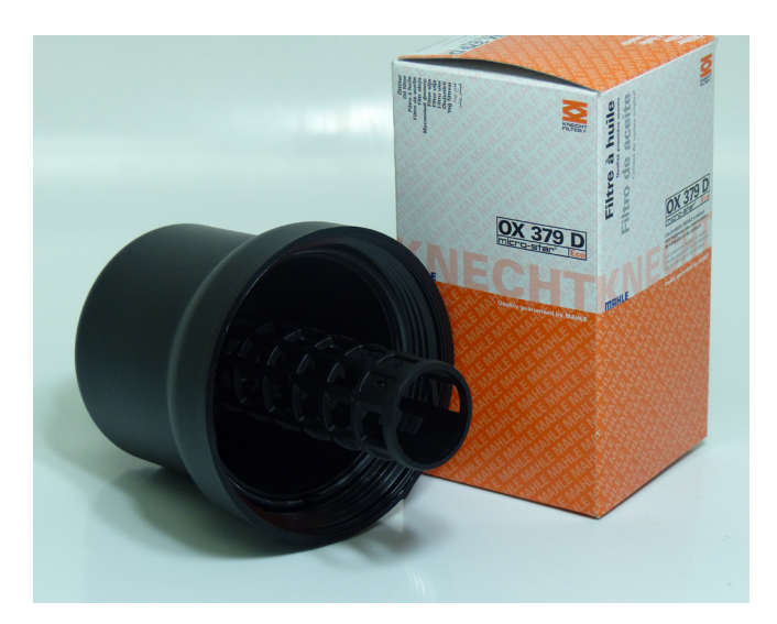
Figure 1: Oil filter insert with disassembled housing cover

In the case of the gaskets for the filter inserts mentioned above, it's also important to ensure that the spring fixing plate is facing upward and is visible in the cover (see Figure 3). If the gasket is installed the wrong way around or the spring fixing plate gets stuck in the thread (see Figure 4), this can cause oil leakage at the filter cover.