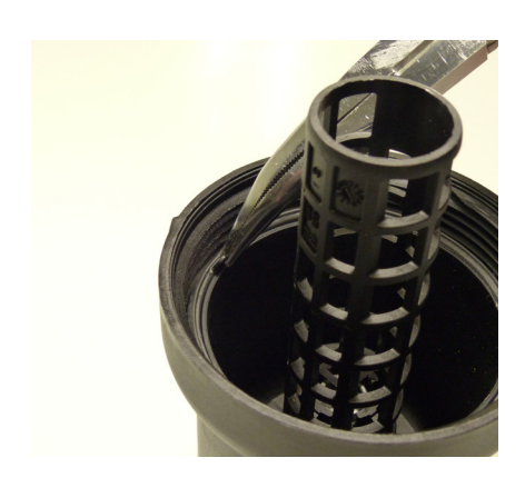
Figure 2: The spring fixing plate can be used to remove the old gasket