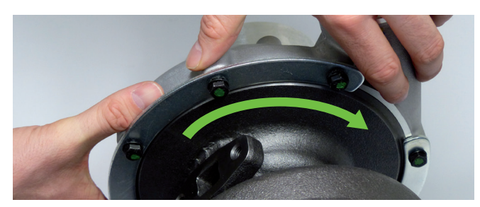
Figure 3: The housing can be adjusted by rotating to the installation position

Important: After assembling a turbocharger, it must be tested for leak tightness and proper functioning. The installation note enclosed with the turbocharger must be observed in all cases! This information can also be downloaded in PDF format at www.mahle-aftermarket.com.