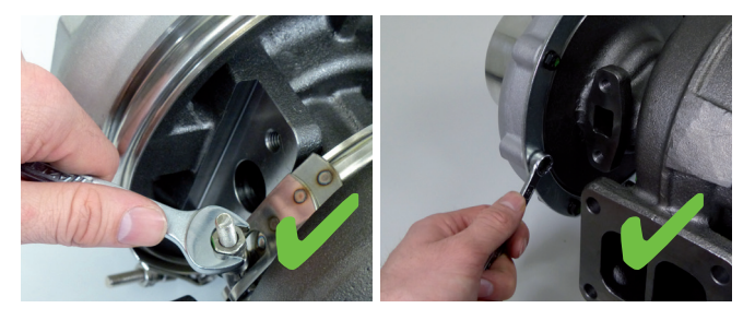
Figure 2: Clamping collars and bolts may be loosened for adjustment