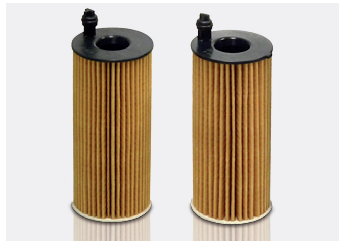
Figure 1: Almost identical oil filter inserts: OX404 on the left and OX813/1 on the right

IMPORTANT! Prior to installation, please check whether you have the correct oil filter insert and ensure where appropriate that a locating tab is visible inside the insert (see figure 2).