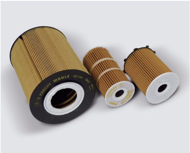
Figure 3: Different filters—same technology. Fleece end caps in different versions