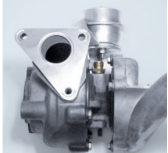
Figure 1: Example for 021TC15195000: The gasket left is installed correctly; the right one is the wrong