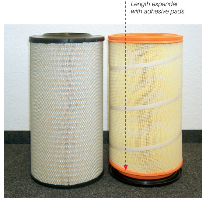
Figure 2: Filter height with affixed length expander: 525 mm