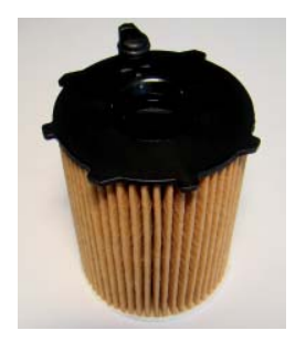
Figure 1: Plastic end disc with patented pin

Which ever MAHLE Original or Knecht filter you look at you can find several patented features, some which improve the filter performance and others which make the fitting easier, more effective and eco-friendly. On the OX 171/2 D, which is fitted to Citroën, Ford and Peugeot vehicles, there are several MAHLE patents used.