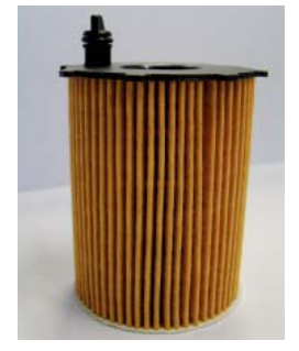
Figure 3: OX 171/2 D

At the other side of the OX 171/2 D you can find another patent: The pin at the plastic end disc. This pin arranges for a controlled oil drain when the filter is removed from the housing, so the used oil can be easily caught and disposed of in an eco-friendly manner.