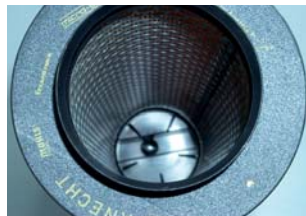
Figure 2: Filter interior view with housing cover – with mounted housing cover the MAHLE filter is also one-side closed as the original filter