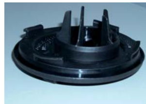
Figure 3: Housing cover – with cone