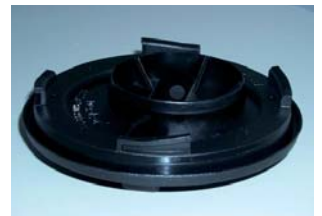
Figure 4: Housing cover – without cone