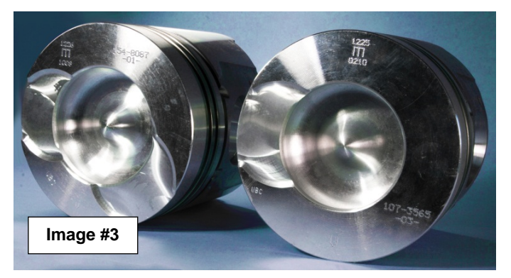
Image #3 shows the piston crowns of these same two pistons. Notice how two pistons with the same casting number can have distinctively different crown designs. The piston on the left (OE# 154-8087) has two valve pockets and piston on the right (OE#107-3565) has only one valve pocket.

This is just one example where using a casting number could lead to a misapplication of parts.