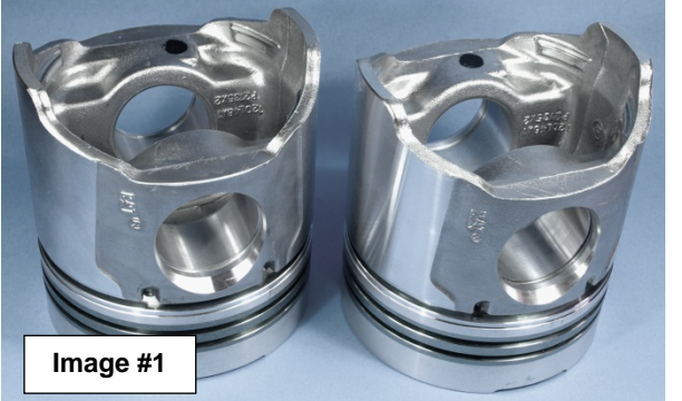
Image #1 shows two Genuine OE Caterpillar<sup>®</sup> pistons with the same casting numbers.

Images #2A and 2B show a close-ups of the casting numbers for these same pistons.