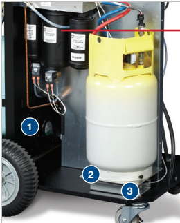
Interior – LH side