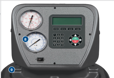
Easy to use control panel