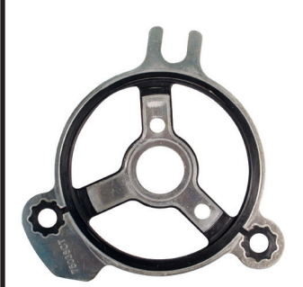
[Polyacrylic (ACM) Rubber]