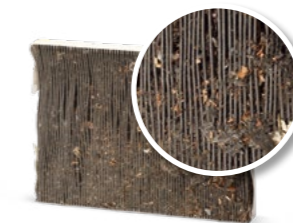
Without A/C maintenance