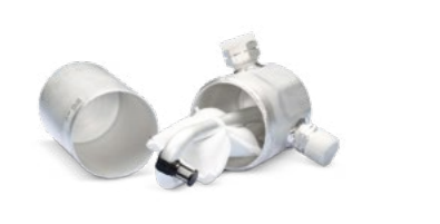
With A/C maintenance