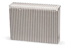
With A/C maintenance