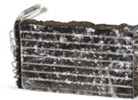
Without A/C maintenance