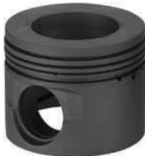
Cast iron piston