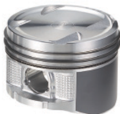
Aluminum gasoline piston