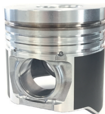
Aluminum diesel piston