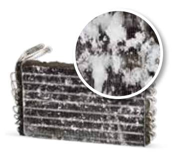
Without A/C maintenance