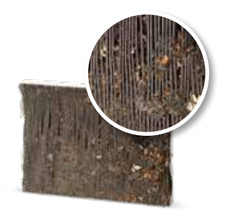
Without A/C maintenance