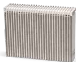
With A/C maintenance

The filter-drier removes dirt particles from the refrigerant and absorbs moisture. As the capacity of the filter-drier is limited, it must be regularly replaced so that the A/C system can function reliably.