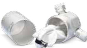
With A/C maintenance