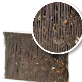
Without A/C maintenance