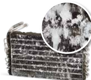
Without A/C maintenance