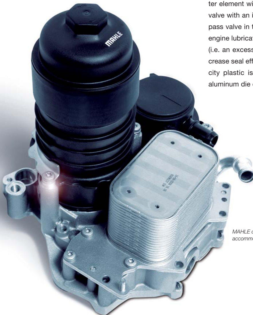
MAHLE oil filter module – several components are accommodated on a single support plate.

The oil filter assembly consists of a cover, a housing, the filter element with an all-plastic oil filter, and a filter by-pass valve with an integrated clip for the oil filter insert. The by-pass valve in the cover guarantees a reliable supply of the engine lubrication points at a cold start or filter malfunction (i.e. an excessively soiled filter). To reduce weight and increase seal effectiveness, fiberglass-reinforced high-capacity plastic is employed instead of the otherwise usual aluminum die casting alloy.