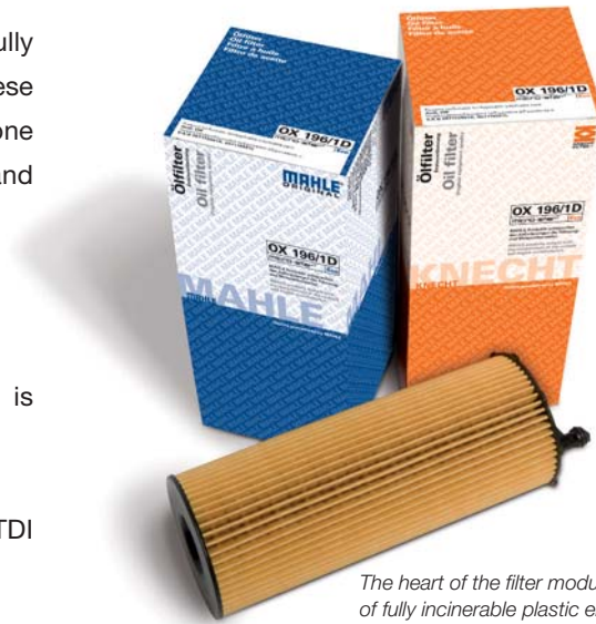
The heart of the filter module: the oil filter element of fully incinerable plastic end disks and long-life filter paper.

Apart from the oil filters described here, MAHLE also has fuel, air and cabin air filters in its program for the corresponding vehicle models, which like all MAHLE products are distinguished by exact fitting accuracy, high functionality and reliability ... providing a significant contribution to the satisfaction of your customers.