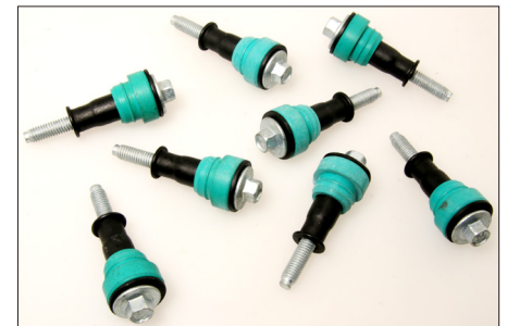
GS33439 - Bolt set with grommets