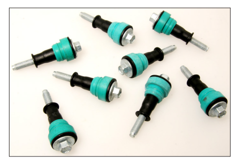
GS33439 - Bolt set with grommets