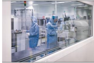
Electronics and mechatronics are important growth areas for MAHLE: image shows production of electronic components in Motilla/Spain.